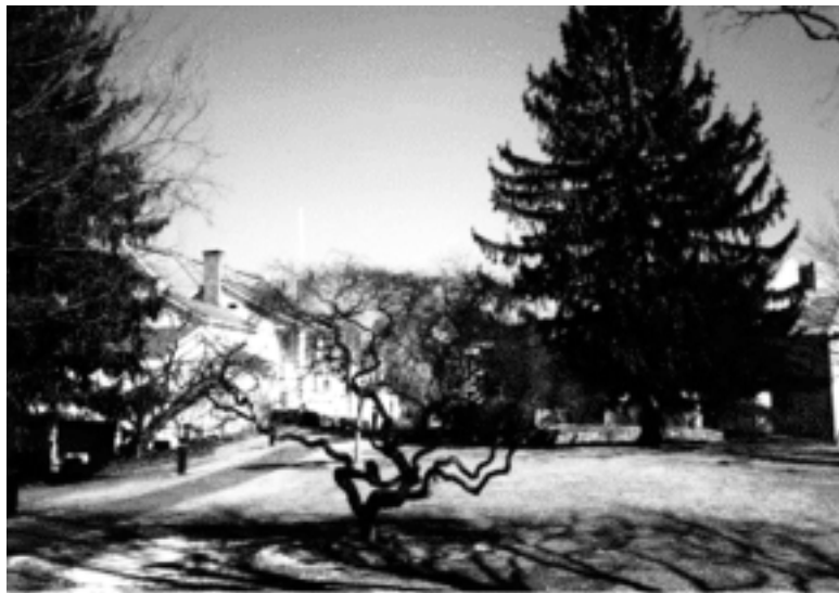
Figure 2 GE University Campus

Note: The GE Crotonville University in Ossining, New York has a lush 53-acre campus studded with many educational facilities, recreational facilities, and dormitories. Every year, 6,000 to 8,000 GE employees from around the world visit to take required courses. MBO and SWOT analysis, business screen analysis, and the six sigma method were developed here.